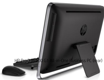
HP ProOne 400 G1 All-in-One Business PC (rear)